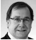
Hon Murray McCully Minister of Foreign Affairs, New Zealand

Hon Murray McCully is a senior Minister in the New Zealand Government, holding the portfolios of Foreign Affairs and Sport and Recreation.