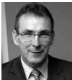
Andris Piebalgs Development Commissioner, European Union

Mr McCully holds an LLB and is a qualified barrister and solicitor. Prior to entering Parliament, he was principal of a major public relations company.